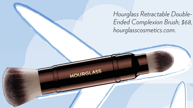
Hourglass Retractable Double-Ended Complexion Brush; $68, hourglasscosmetics.com .

Necessity is the mother of invention. I learned this right away when I started my travels in the modeling and fashion industry years ago. Packing for last-minute trips — sometimes for multiple climate zones, and preferably all in one suitcase — taught me to develop an effective approach for choosing full-sized beauty products that offer maximum benefits while taking minimum space. My “Travel Beauty Superheroes” system consists of three main groups — Formulators, Constructors and Alternatives — and each boasts its own special superpower. Let’s explore this summer’s best.