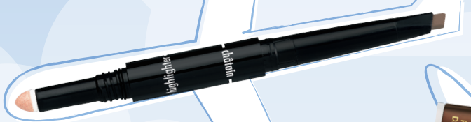
Sisley Paris Phyto-Sourcils Design 3-in-1 Brow Pencil in Chestnut; $62, sisley-paris.com .

Constructors Clever packaging delivers a multitude of beauty functions.