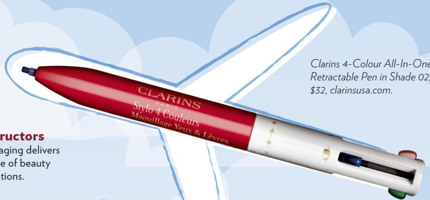
Clarins 4-Colour All-In-One Retractable Pen in Shade 02; $32, clarinsusa.com .

Constructors Clever packaging delivers a multitude of beauty functions.