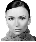
BY NATASHA CHALENKO

Brick-and-mortar or click-and-ship? For my holiday gift shopping I prefer to shop brick-and-mortar. There is something incomparably special about choosing a crisp sunny San Francisco day and taking a stroll through all of my favorite stores, and perhaps, checking out a couple of new ones along the way. I just go with the flow. I like to look through the goods, chat with my favorite salespeople and imagine what would make people on my list happy. But I am very selective as to where I shop. I choose the brands that have unparalleled commitments to exceptional craftsmanship and uncompromised quality, support and developed artisanal traditions, rise above trends and respect their resources and communities. So bundle up and let's discover something stylish for everyone on your list, including you!